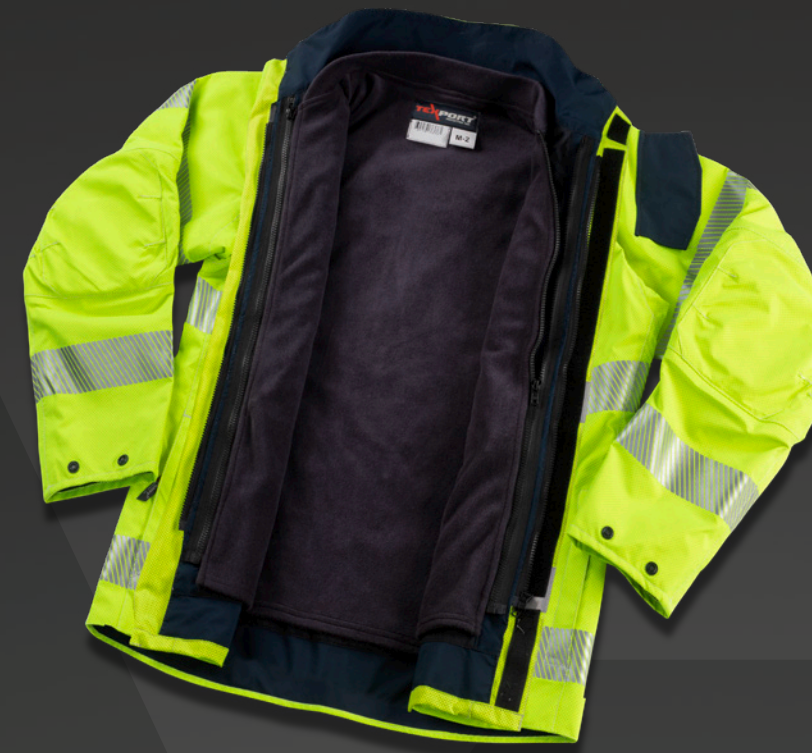
Fig. SUPERIOR Thermal lining, inner jacket, QA09, Navy 208 in combination with SUPERIOR 20471, TA06, HiVis yellow / dark blue 537