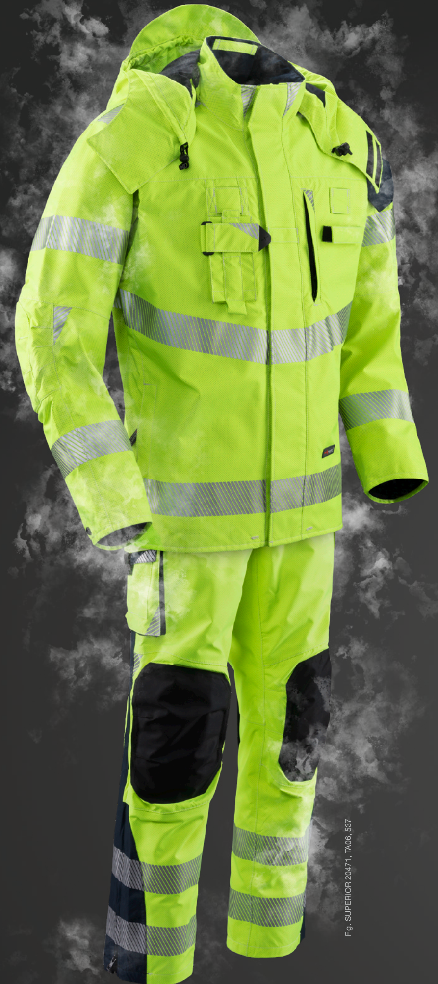
Fig. SUPERIOR 20471, TA06_537