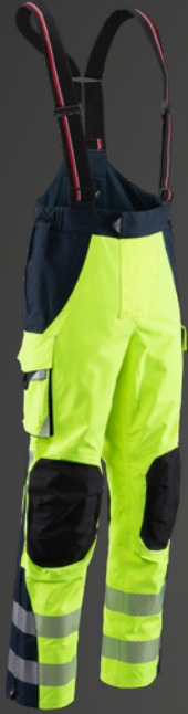
Fig. SUPERIOR 20471, TA19, HiVis yellow / dark blue 537