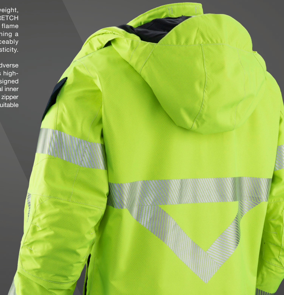
Fig. SUPERIOR 20471, TA06, HiVis yellow / dark blue 537

The SUPERIOR provides enhanced protection in adverse weather conditions, at dusk, or at night through its high-visibility properties (EN 20471) and a specially designed reflective stripe arrangement. With the optional thermal inner jacket, which can be zipped into the SUPERIOR using a zipper system, as well as the optional hood, the garment is suitable for year-round use and all weather conditions.