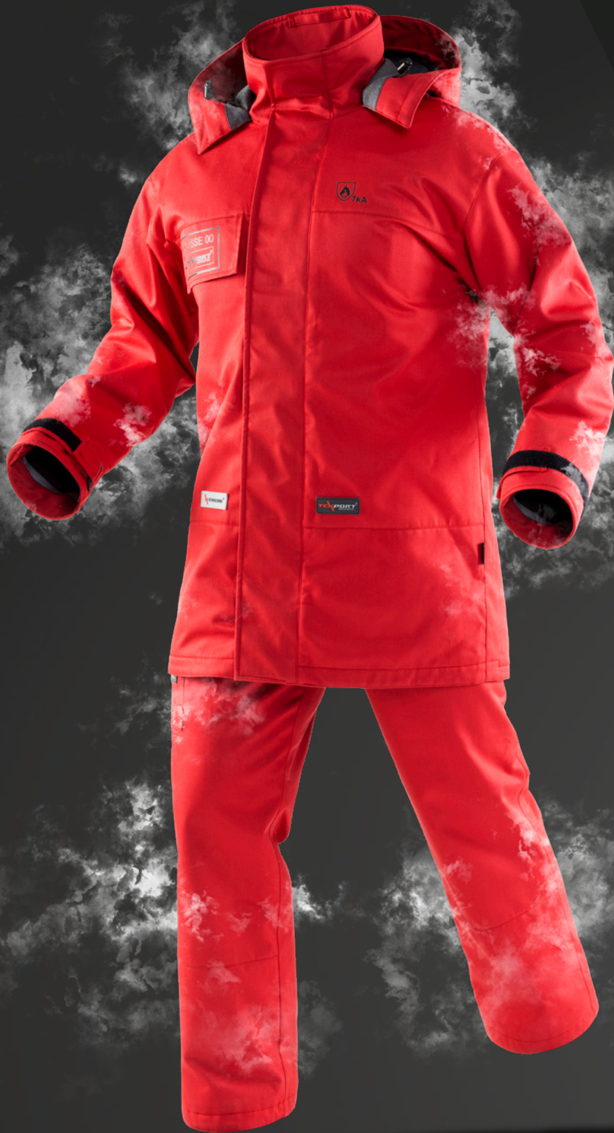
Fig. POWER PROTEC AUS, YA18, 153