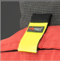
Drag rescue device jacket, Rescue strap integrated

Fire Survivor TTFS includes as standard an integrated drag system in the upper back area of the jacket as well as left and right sided on the upper thighs which is both made of Aramid-webbing. This facilitates the immediate rescue of a fireman from a directly life-threatening situation.