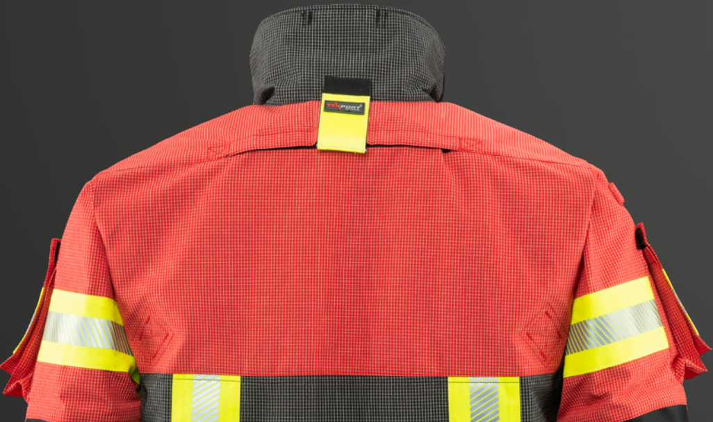
Fig. Fire Survivor TTFS, YA14, 526