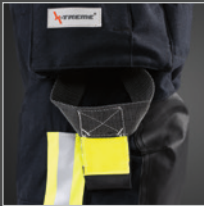
Drag rescue device trousers, Rescue strap, both sides