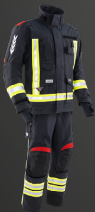
Fire Stretch jacket and trousers Nomex® NXT dark blue 203