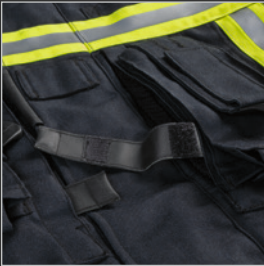
Loop-system tab Pocket opener and carabiner take out

The varied belt systems stand out through heat protection, comfort and simple handling. Thanks to the extensive range of accessories, there is also the possibility to put together systems individually and in doing so to meet the most varied requirements of a fire department. Another advantage is that the harness / rescue strap can very easily be threaded in and out through the well-thoughtout design. Therefore, standard inspection, maintenance and correct cleaning of the jacket are made easier.