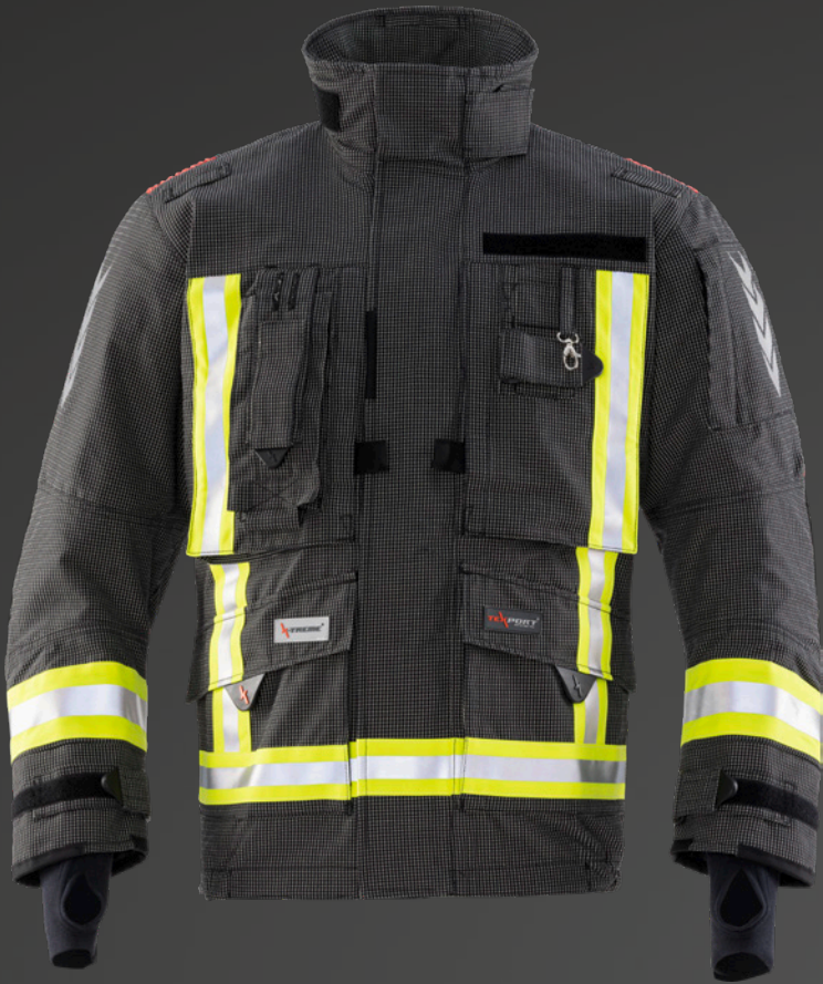
Fig. Fire Stretch Jacket, YA14, 203