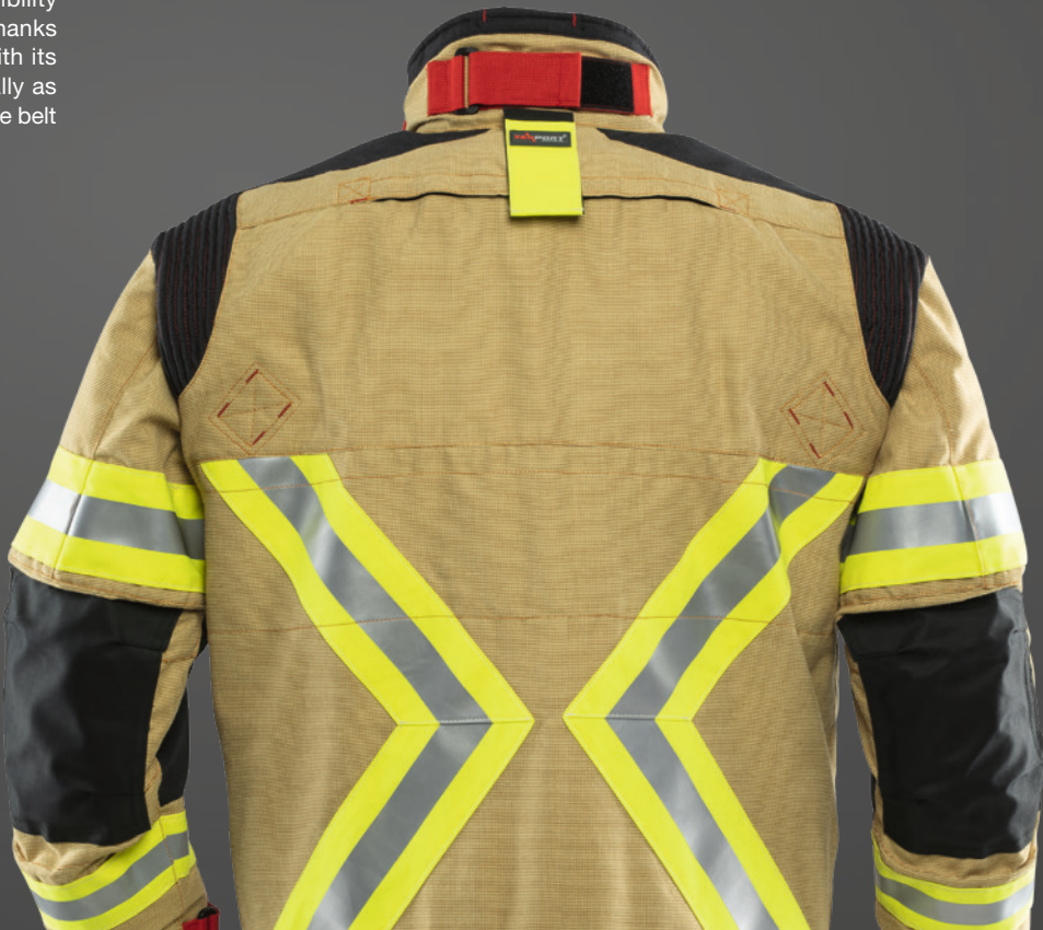
Fig. FIRE PHOENIX, ZA15-A, 544

The FIRE PHOENIX by TEXTPORT combines the highest level of protection, a fresh design and top functionality in one suit. Inspired by a heroic look, it stands out with a unique optic for protective clothing, optimal visibility in use and the highest level of wearing comfort, thanks to a special cut and form. The FIRE PHOENIX, with its Drag and Loop system, can also be used optionally as an integrated rescue system (IRS) with our innovative belt system series.