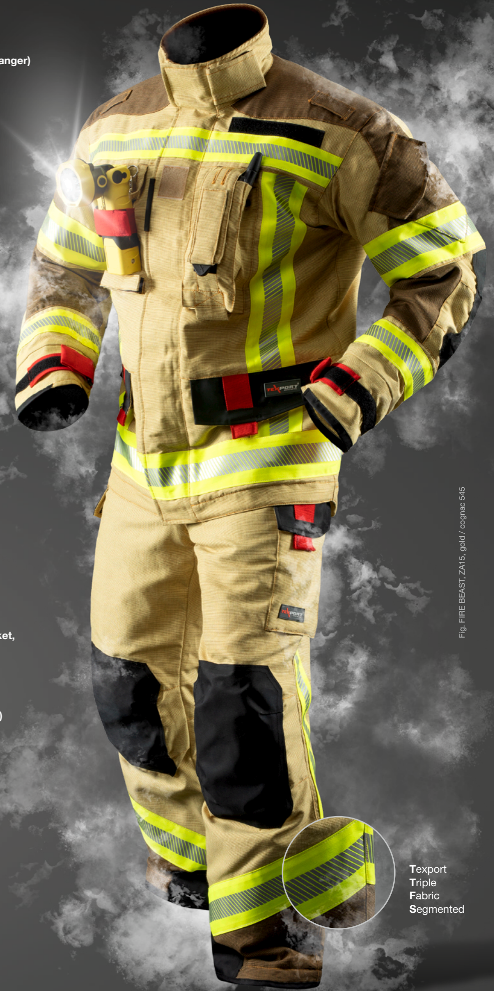
Texport Triple Fabric Segmented