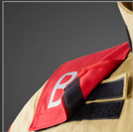
Connection velcro fastener for jacket and collar

The FIRE DRAGON, consisting of FIRE DRAGON jacket NL Utrecht as well as FIRE SURVIVOR trousers NL Utrecht, is a customised fire-fighting suit designed for the specialised requirements of Dutch fire-fighting brigades. The suit combines a perfect fit, high-quality workmanship as well as optimal visibility in a special Dutch house style, combined with the individual requirements on the equipment. The identification collar NL which is available separately can be affixed to the jacket using the integrated velcro fastener.