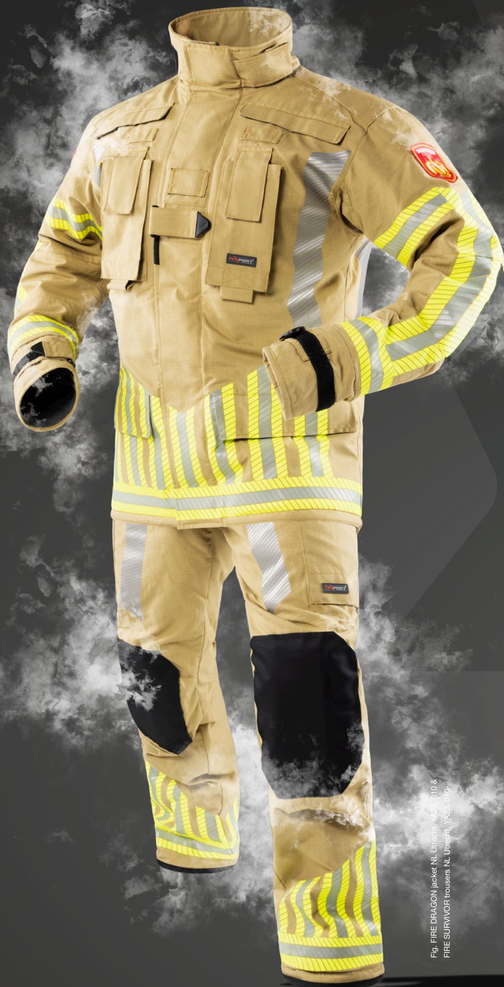
Fig. FIRE DRAGON jacket NL Utrecht, YA23, D10 & FIRE SURVIVOR trousers NL Utrecht, YA23, D10