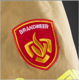
Brandweer coat of arms