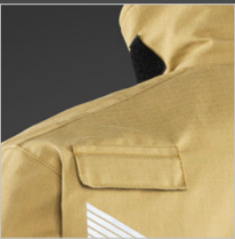
Connection velcro fastener for jacket and collar