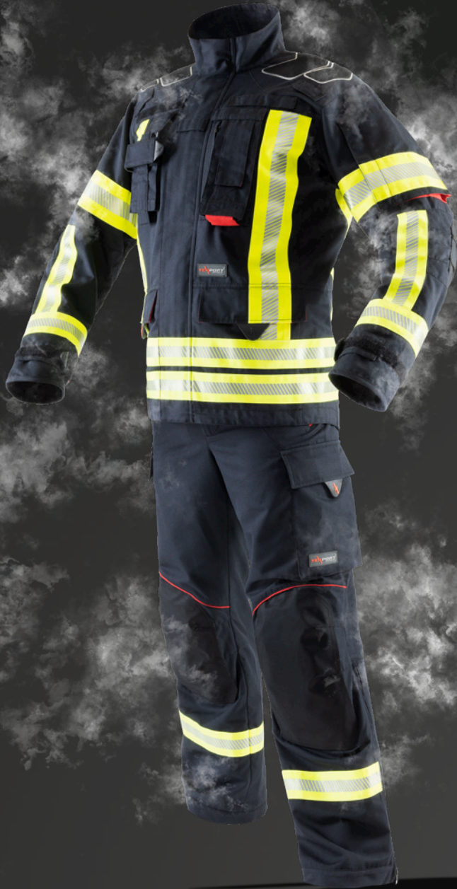
Fig. FIRE RECON WILDLAND, QA61, 203