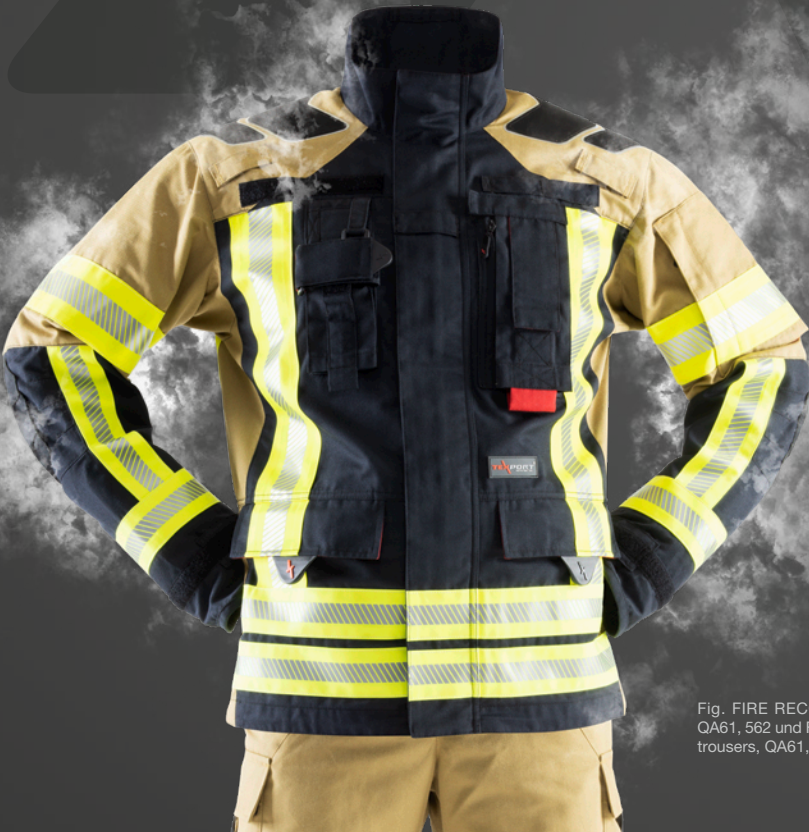
Fig. FIRE RECON WILDLAND jacket, QA61, 562 und FIRE RECON WILDLAND trousers, QA61, 010

Being able to combine jacket and trousers into a closed system prevents rising heat from entering. The width adjustment of the trouser legs and cuffs also takes this into account and thus offers the wearer optimal protection against forest and vegetation fires. The FIRE RECON is also available in a THL version with increased visibility.