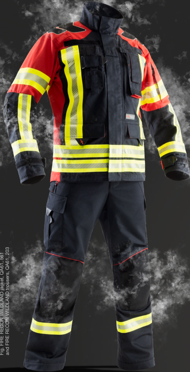
Fig. FIRE RECON WILDLAND jacket, QA61, 561 and FIRE RECON WILDLAND trousers, QA61, 203