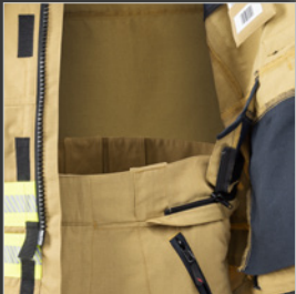
Connection zipper for jacket and trouser