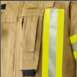
Radio pocket length adjustable, with side zipper