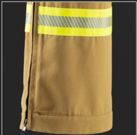
Step-in gusset easier donning and doffing