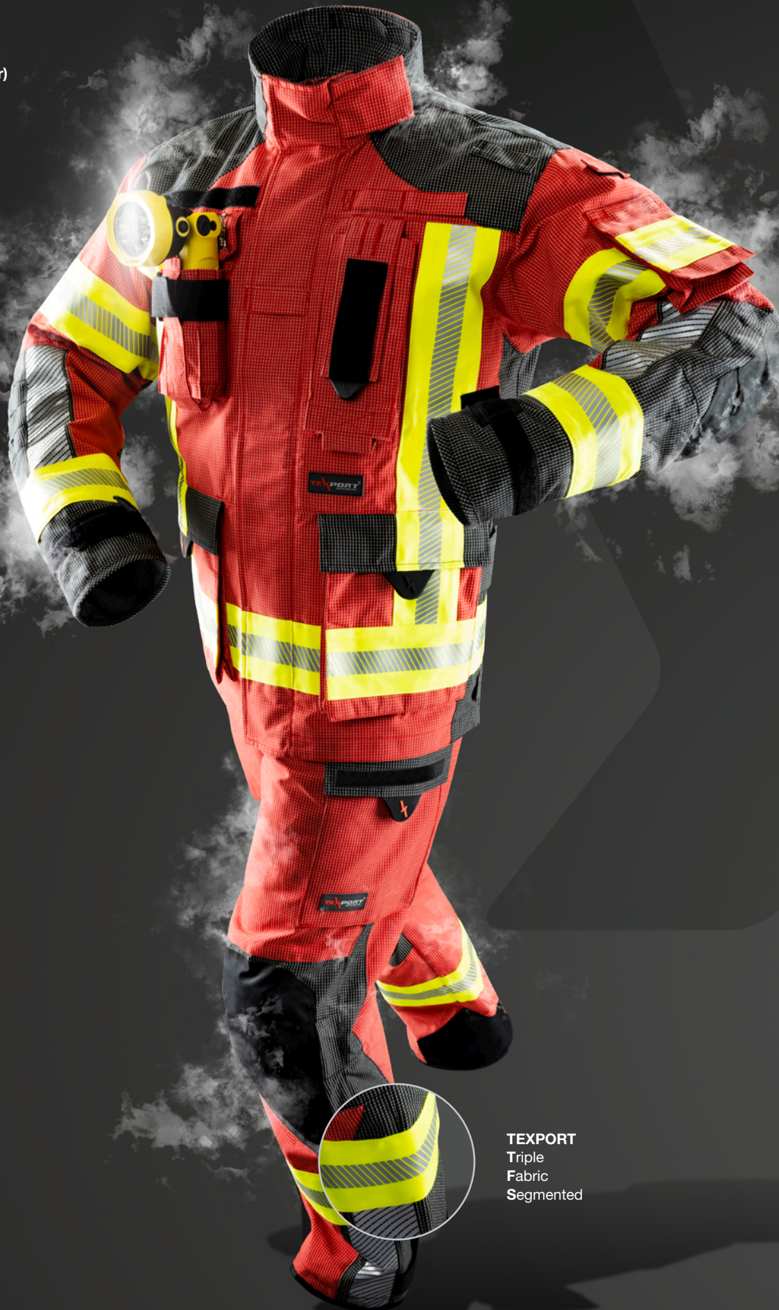
TEXPORT Triple Fabric Segmented