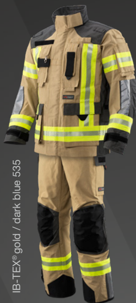
IB-TEX ® gold / dark blue 535