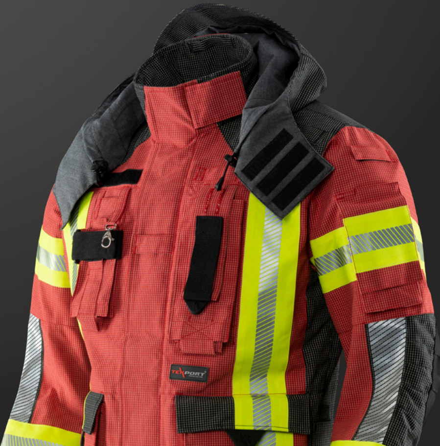
Fig. GUARDIAN RSQ jacket, PA06, 539 with hood, PA06, 203