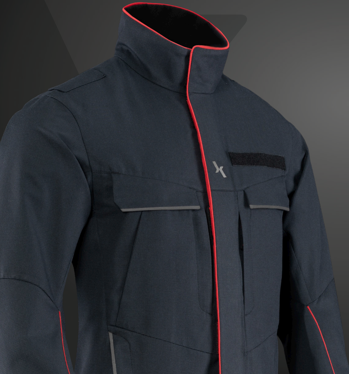
Fig. X-PULSATE FR jacket, RA39, 204

The new fabric (Nomex® / viscose) impresses with good mechanical values and light weight. The fabric remains colour-fast even after several washes and offers outstanding wash resistance.