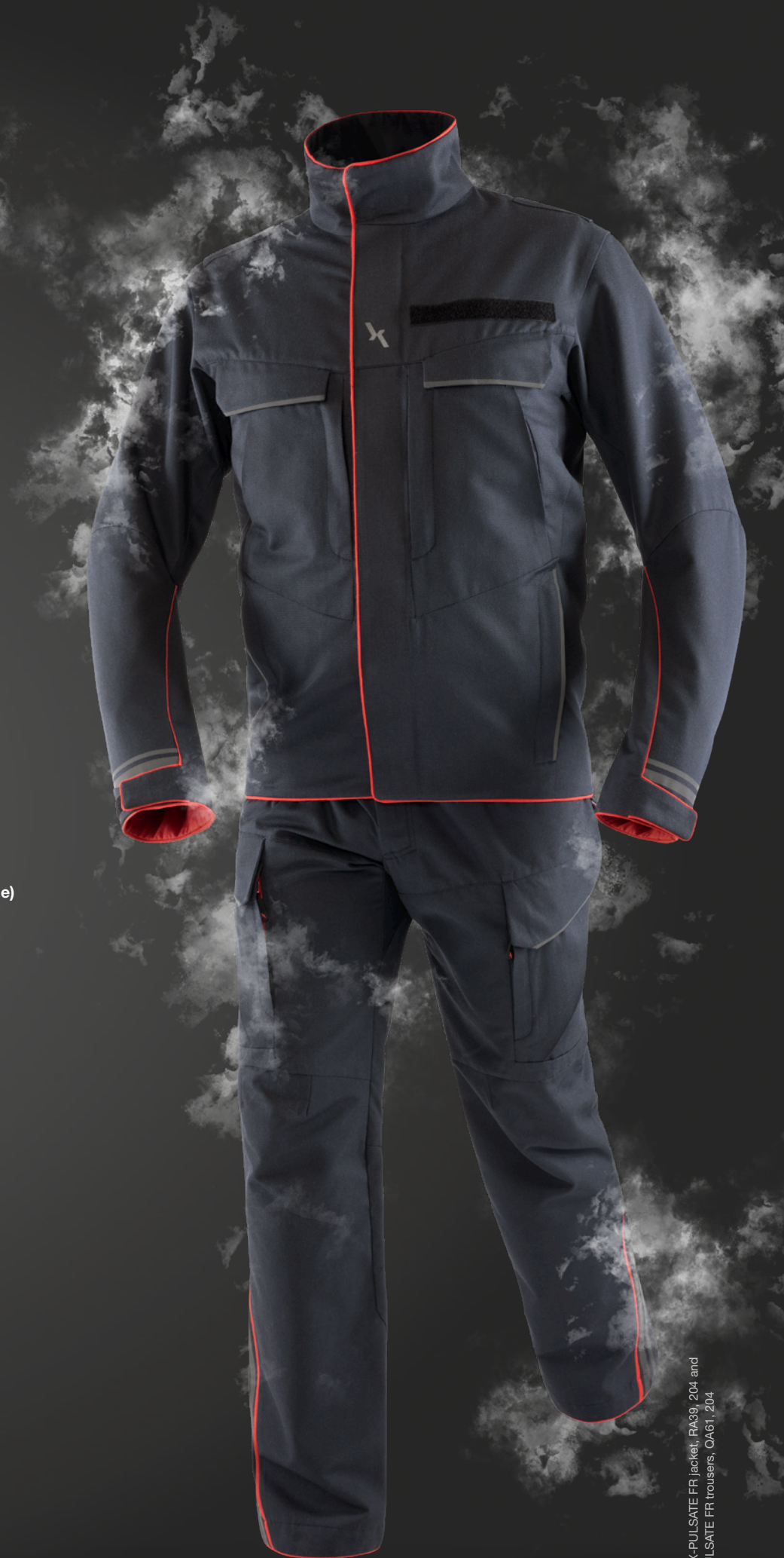
Fig. X-PULSATE FR jacket, RA39, 204 and X-PULSATE FR trousers, QA61, 204

AND IN SINGLE COLOR VARIANT (WITHOUT RED COLOR ACCENTS)