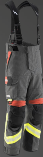
FIRE X-FLASH IB-TEX® dark blue / gold 542