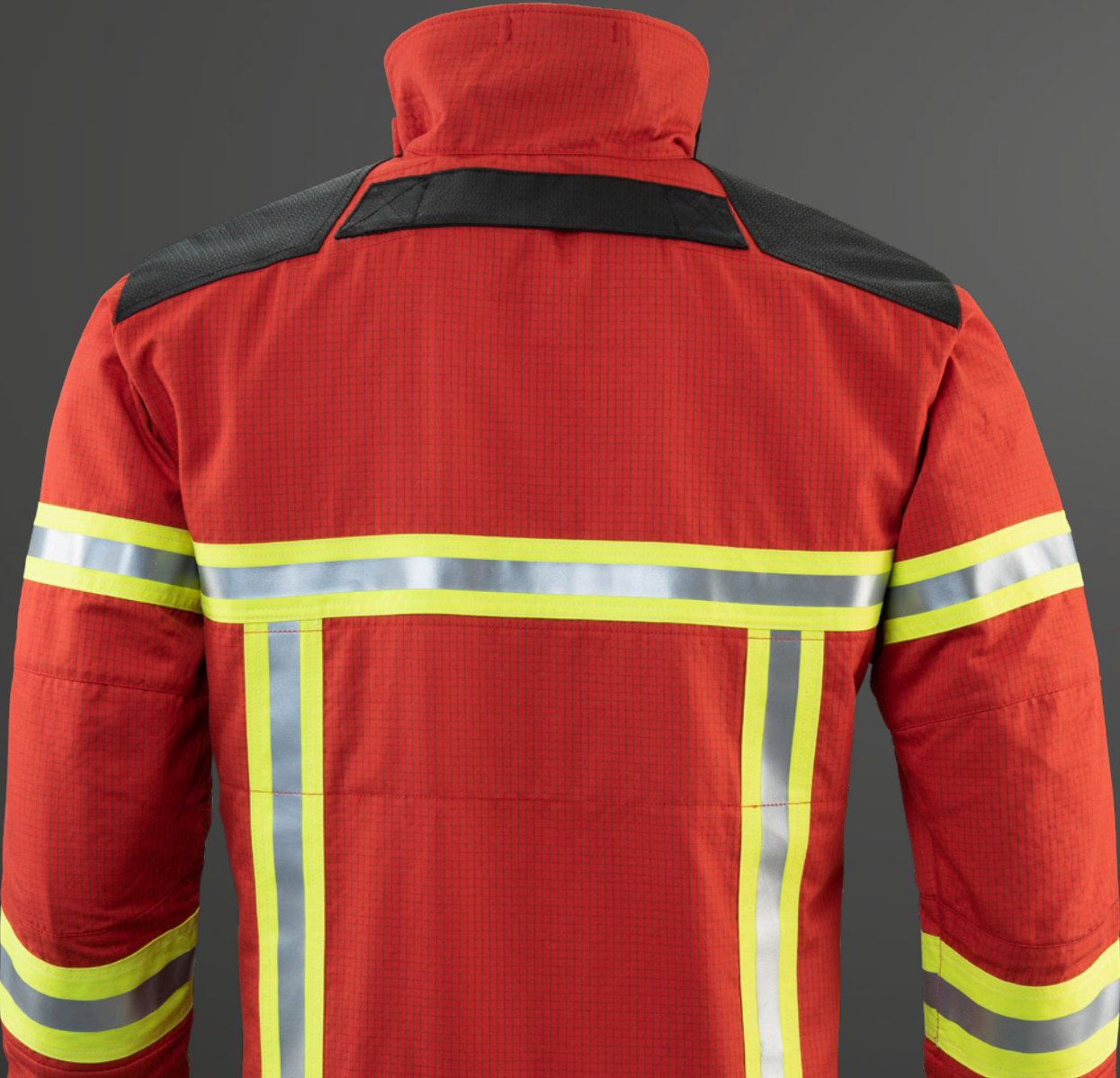
Fig. NX 2012 jacket Loop, red 153

For all NX 2012 jackets with the standard loop-system included, our innovative belt system series by TEXPORT can be used optionally as an integrated rescue system (IRS). The various belt systems are characterised by heat resistance, wear comfort and easy handling. Thanks to extensive accessories there is also the option of assembling the systems individually and so meeting the widest possible range of needs of a fire brigade. Another advantage is that the tether/rescue loop can be very easily threaded in or out thanks to the well-thought-out construction. This makes proper inspection, maintenance and proper cleaning of the jacket easier.