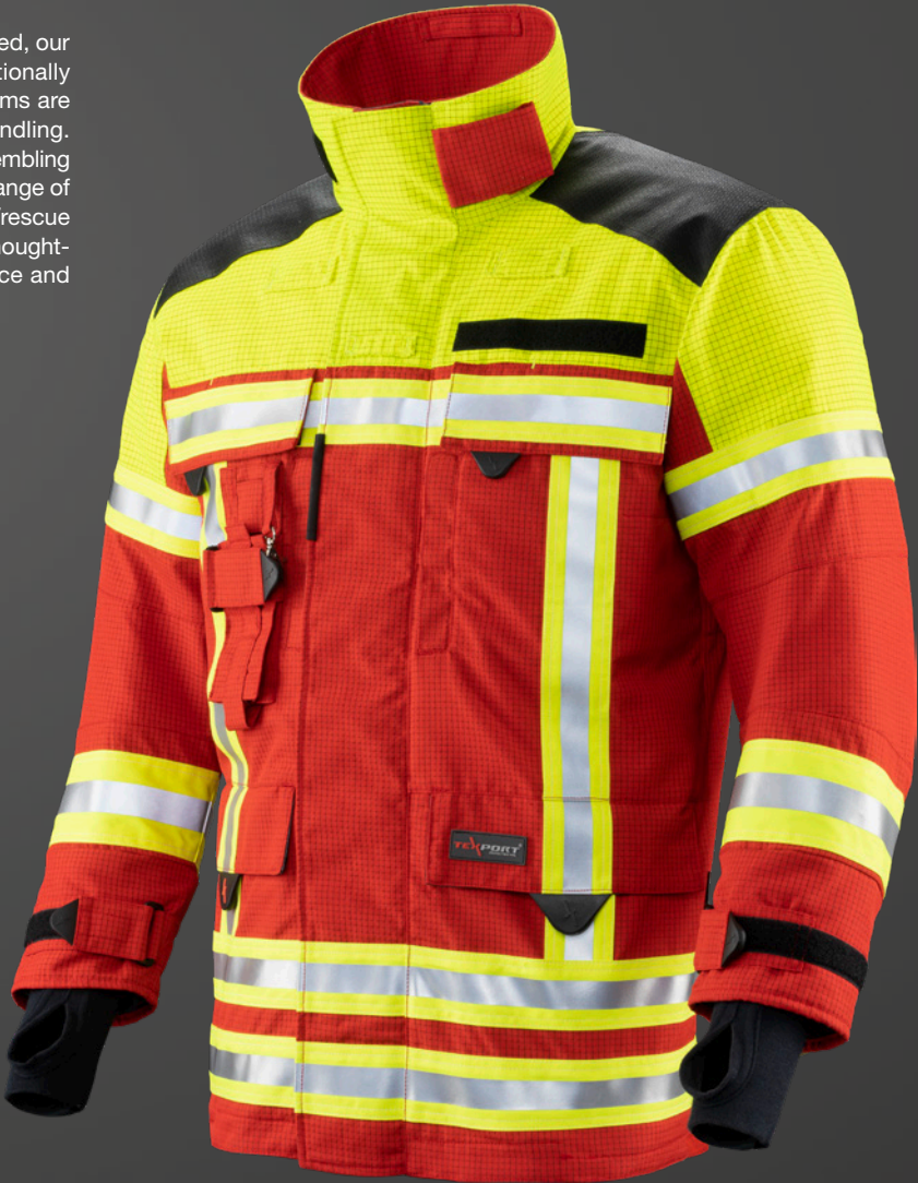
Fig. NX 2012 jacket Loop Bi-Colour, red / yellow 567