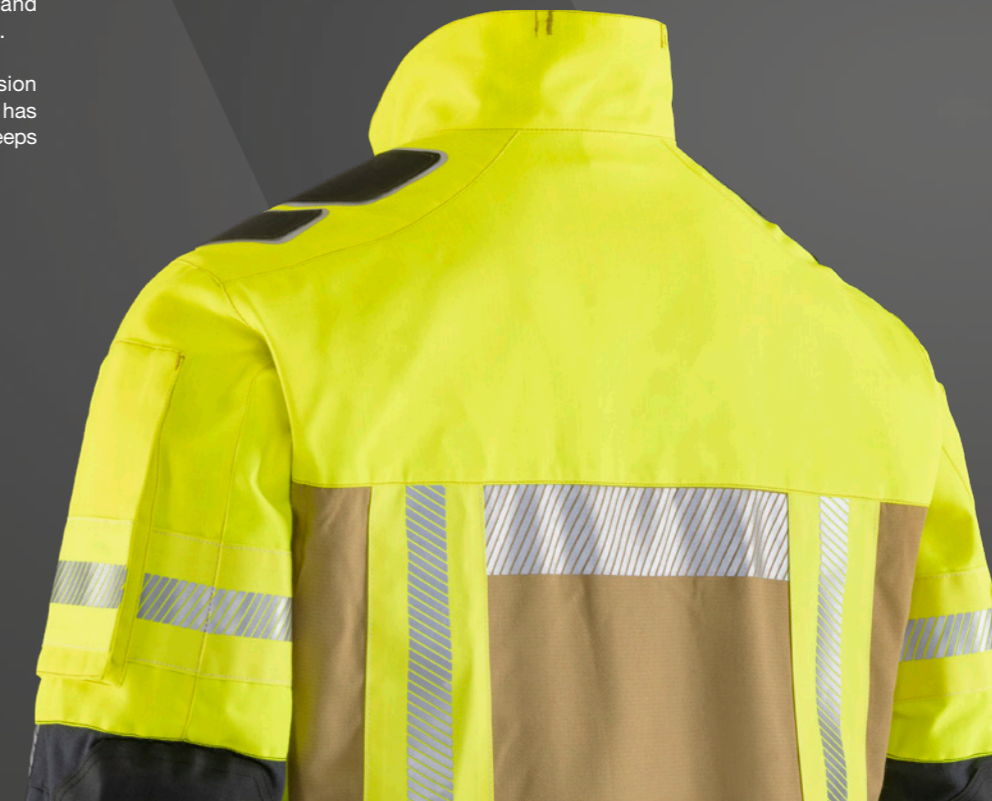
Fig. Fire Recon THL_QA61-A_816