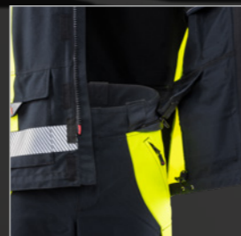
Connection zipper for jacket and pants