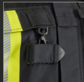
Radio pocket length adjustable, with side zipper