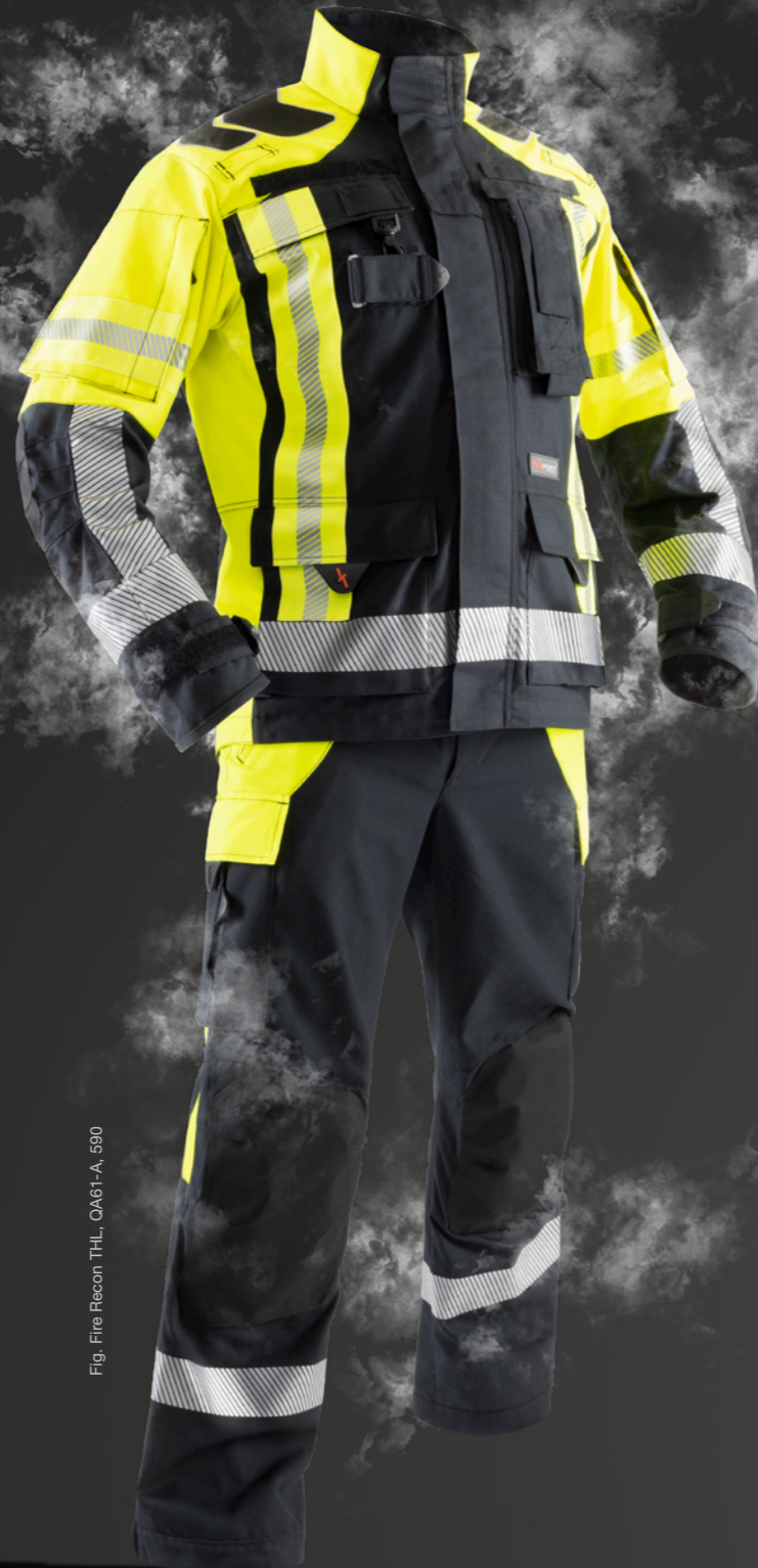
Fig. Fire Recon THL_QA61-A_590