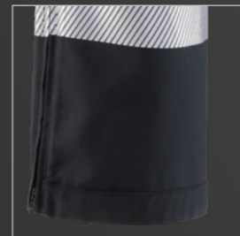
Step-in gusset easier donning and doffing